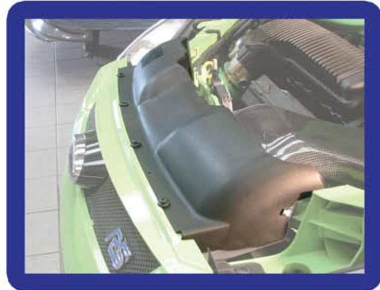
8) Finally refit the plastic cover using the original screws.