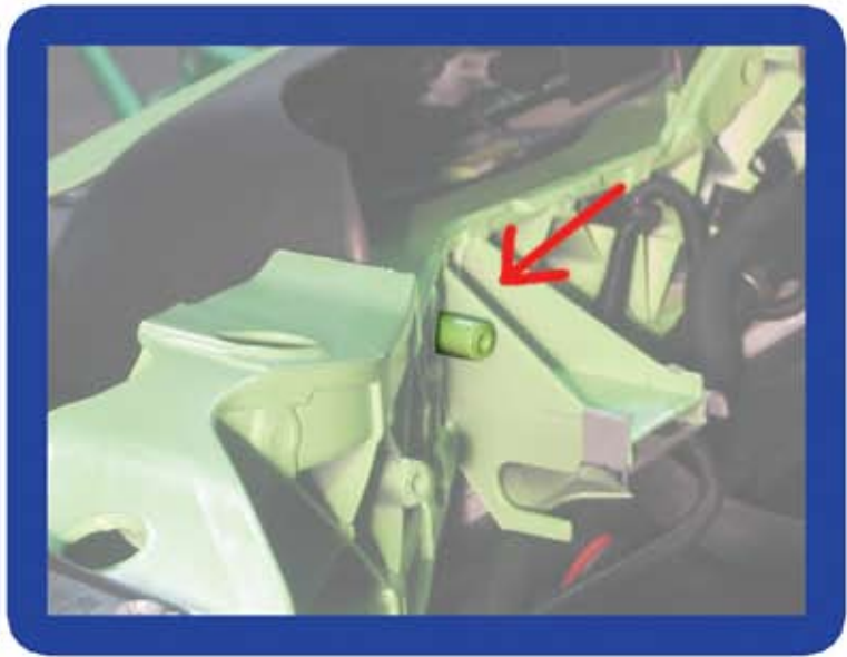
6) Fit rubber cap supplied over arrowed boss.