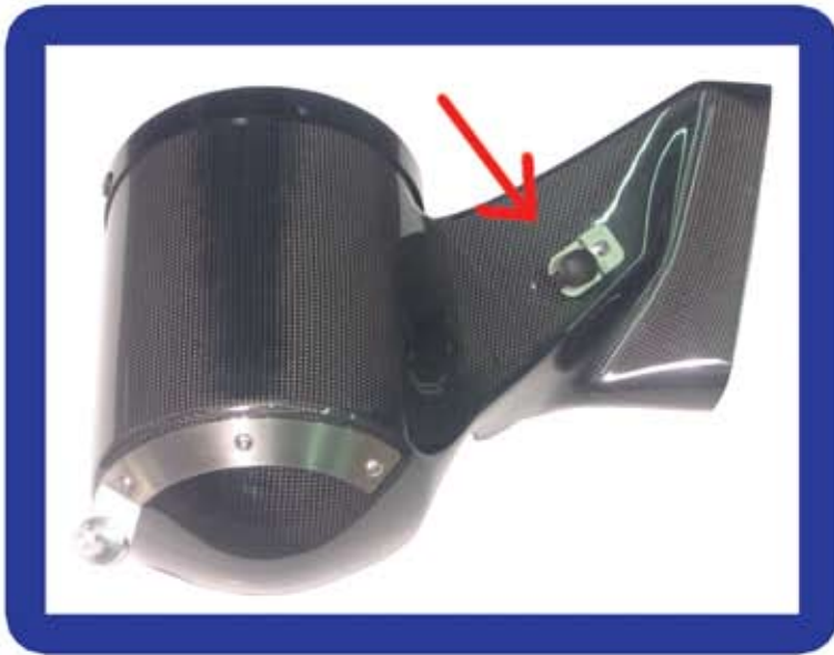
5) Refit rubber support on GGR carbon Airbox.

Focus RS MK2 GGF3001 Carbon Cold Air Induction System