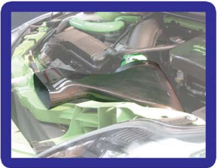
7a) Fit the GGR airbox assembly into position carefully locating the mounting into the original outer rubber mount.